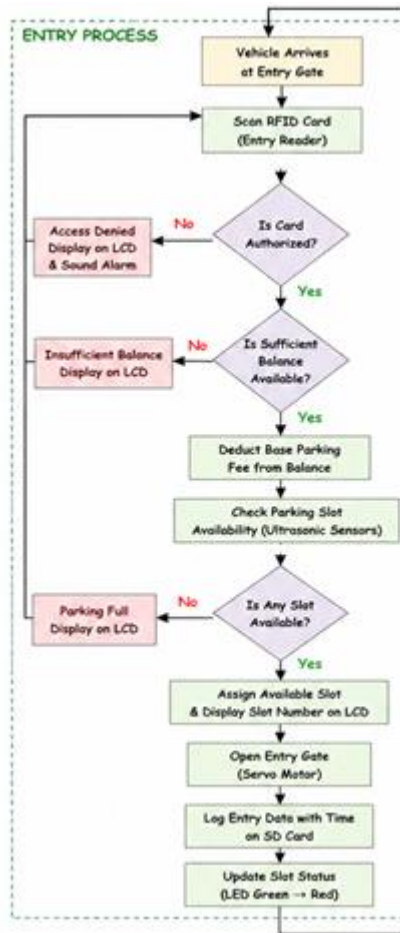
Fig 1: Block Diagram.