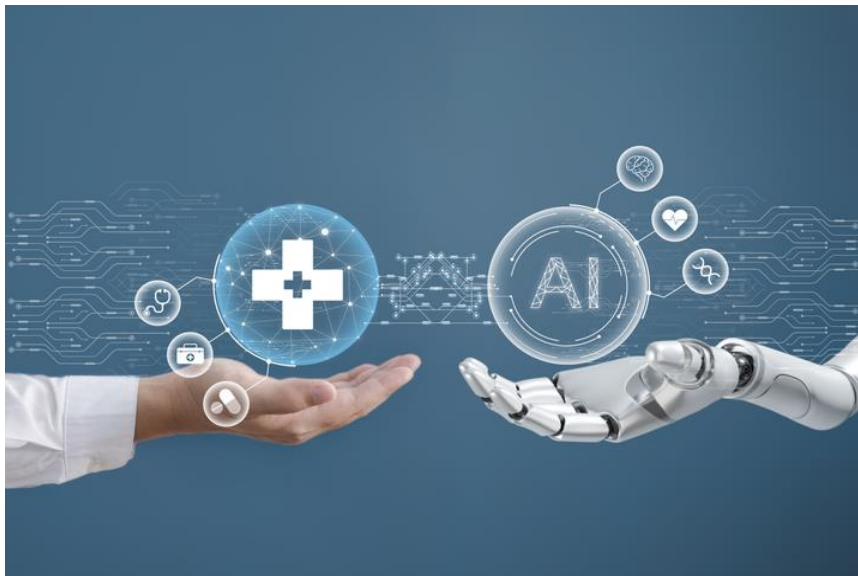
Figure 01: The future of Pharmacovigilance technology.

Despite these advancements, the adoption of AI in pharmacovigilance is still evolving. Challenges such as data quality, algorithm transparency, regulatory acceptance, and ethical considerations must be addressed to ensure reliable and safe implementation. Nevertheless, AI holds immense promise in transforming pharmacovigilance from a reactive system to a more proactive and predictive model of drug safety monitoring (2) .