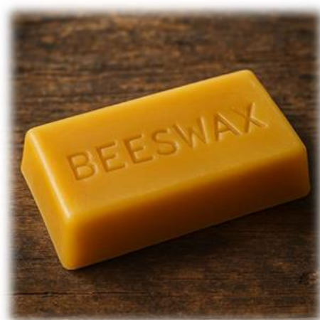
FIG NO. 2: BEESWAX.

Chemically, beeswax is composed primarily of esters of fatty acids and long-chain alcohols, along with hydrocarbons, free acids, and other trace compounds. It has a relatively high melting point, typically between 62 and 64 degrees Celsius (143 to 147 degrees Fahrenheit). The color of beeswax can vary, ranging from almost white to deep yellow or brown, depending on factors such as age, purity, and the pollen and propolis content.