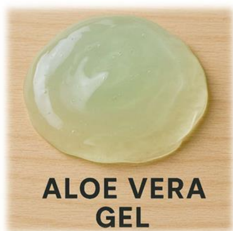
FIG NO. 6: ALOE VERA GEL.

In skincare , Aloe Vera gel is widely appreciated for its cooling and moisturizing effects. It is often used to treat sunburns, minor cuts, insect bites, and skin irritations , thanks to its anti-inflammatory and antimicrobial properties. The gel penetrates the skin quickly, providing instant relief while promoting faster healing. It's also a popular ingredient in creams, lotions, and after-sun products, and is suitable for sensitive or acne-prone skin due to its non-greasy, non-comedogenic nature.