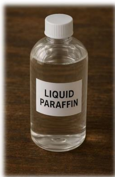
FIG NO. 4: LIQUID PARAFFIN.

In the medical field, liquid paraffin is commonly used as a laxative to treat constipation. It works by softening the stool and easing its passage through the intestines. However, it is generally recommended for short-term use, as long-term usage can interfere with the absorption of nutrients and fat-soluble vitamins. It is also applied externally as a moisturizer for dry, scaly, or irritated skin, forming a protective barrier that locks in moisture.