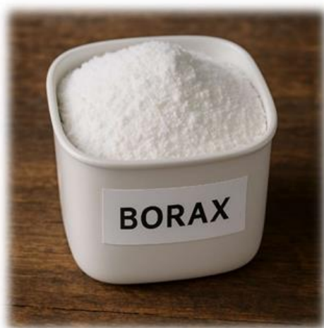
FIG NO. 3: BORAX.

Borax is widely recognized for its cleaning and disinfecting properties, making it a common ingredient in household cleaning products. It serves as a gentle abrasive and has the ability to soften water, enhancing the effectiveness of soaps and detergents. In addition to its cleaning uses, borax is also employed in pest control, particularly for ants and cockroaches, as it disrupts their digestive systems when ingested.