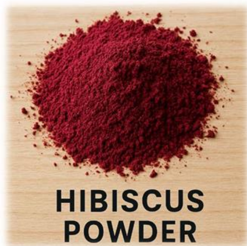
FIG NO. 5: HIBISCUS POWDER.

often called sorrel or agua de Jamaica , is known to help lower blood pressure, support liver function, and boost the immune system thanks to its antioxidant content. Some studies suggest that hibiscus may also help manage cholesterol levels and improve metabolism.