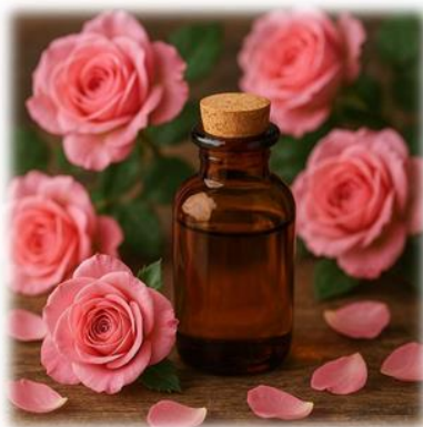
FIG NO. 7: ROSE OIL.

amount of oil, which is why rose oil is one of the most expensive essential oils in the world.